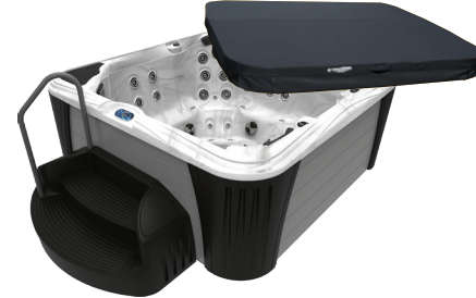
Suite Steps and Handrail with Storage Wide steps with sturdy handrail and side compartments for storage, or planter.

and Cover Lifter Weather and fade resistant lockable energy saving cover with locking safety straps. Plus, convenient cover lifter for opening, replacing and handling your cover.